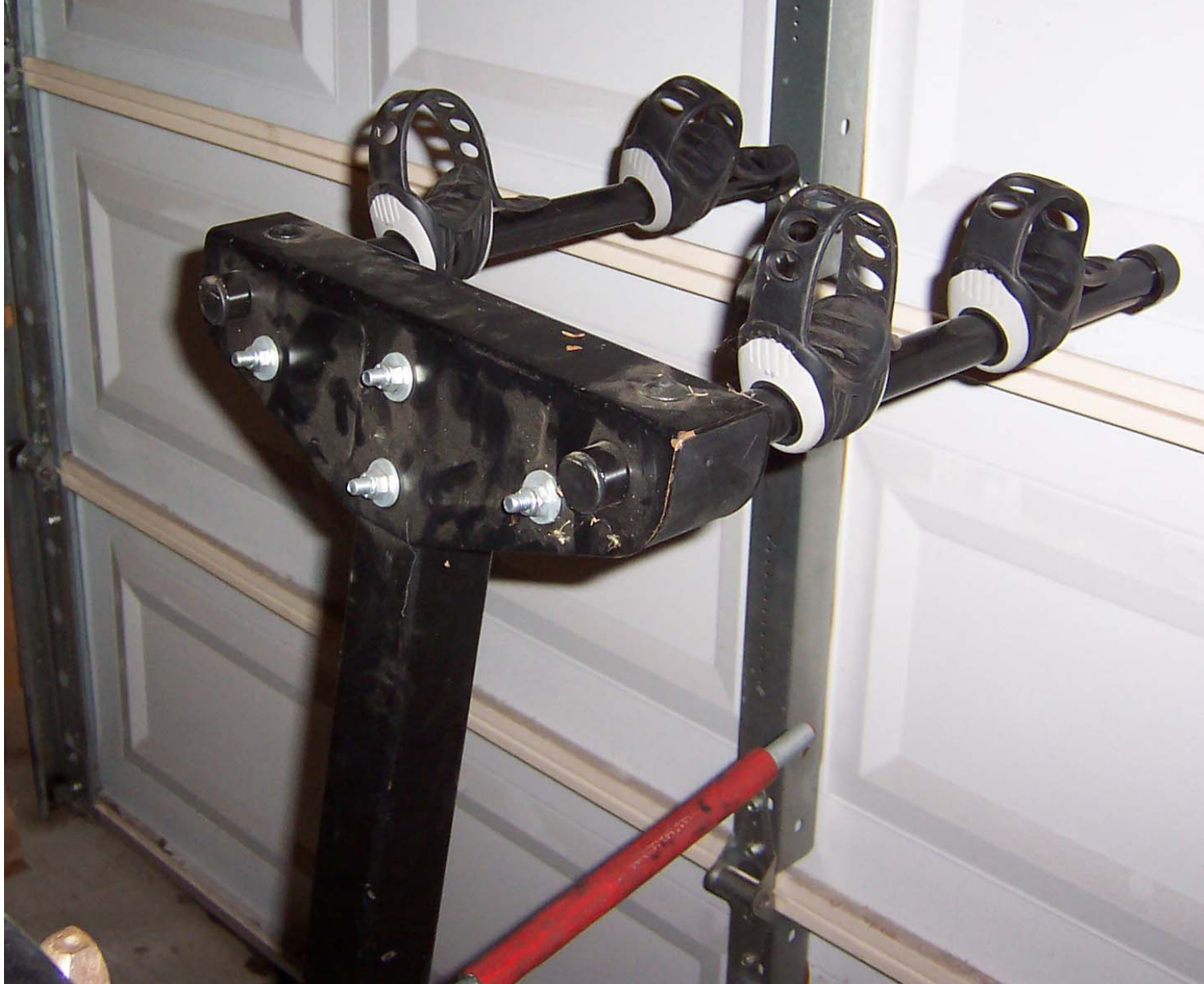
Service part fit easily on frame. Only 2 holes were needed to fasten the head to the frame.