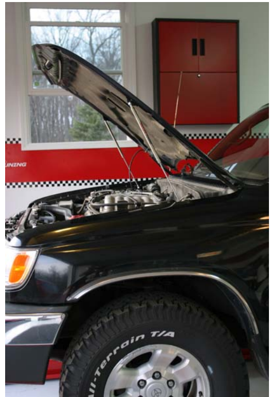
4 Runner with new gas hood struts